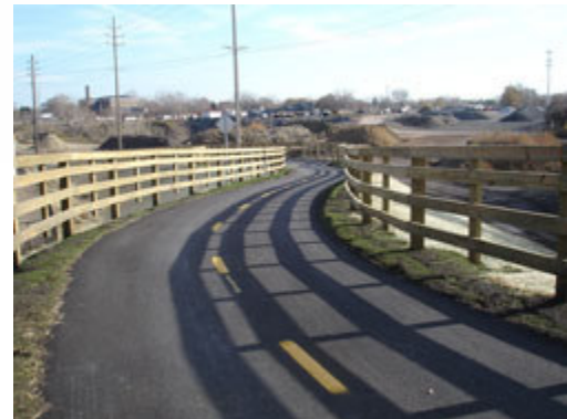
Separation between recreation and industrial uses was a critical design factor