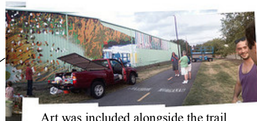
Art was included alongside the trail