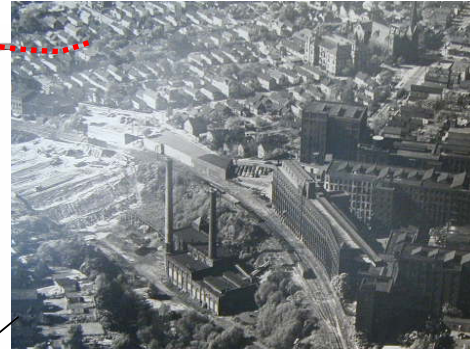
The trail alignment weaved between Brownfields and Historic Industrial areas